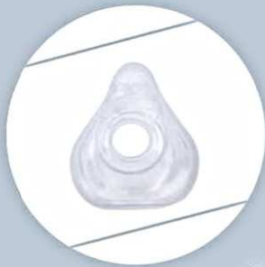
Double Frame Silicone Body