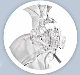
Adjustable polycarbonate head support