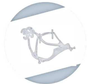
Reinforced Polycarbonate Frame