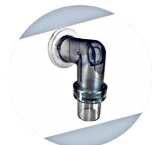
Nonvented Elbow Connector for noninvasive ventilator usage