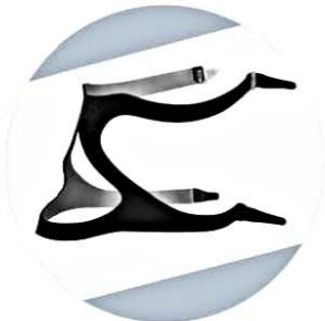
Breatheable Foam Headgear